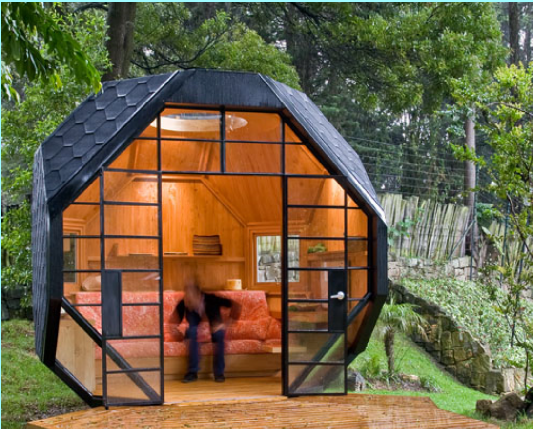
Polyhedron Living Space Architect: Manuel Villa