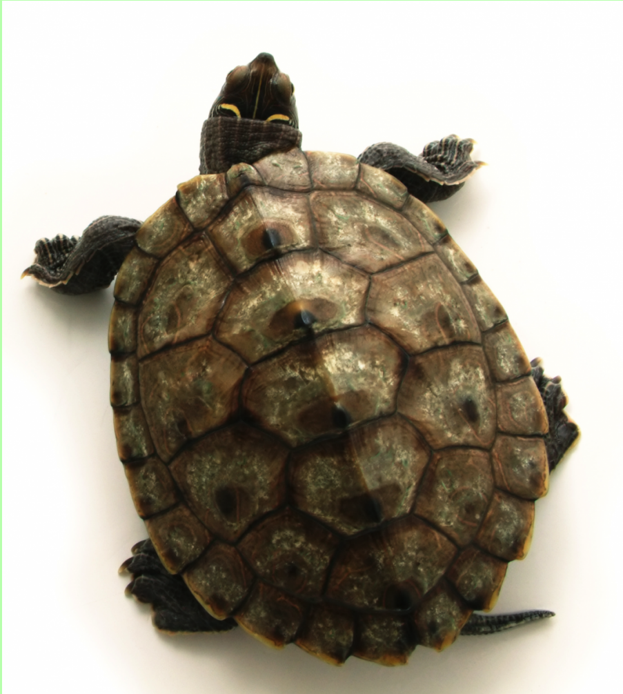
Turtle Shell Mesh Formation