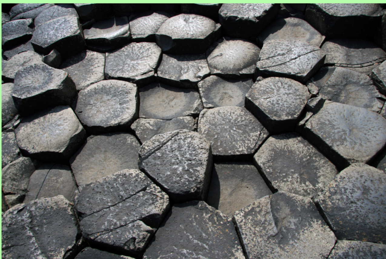
Bushmills, Northern Ireland Volcanic Basalt Rock Hexagonal Columns

Polyhedrons in nature have more connections over an area vs mesh formations therefore a greater amount of information can be spread among the surface though the increased amount of connections available in this type of shape.