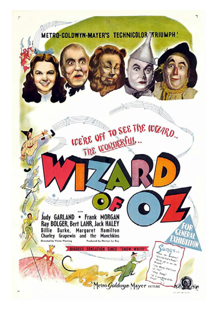
The Wizard of Oz, Warner Bros Production, Victor Flemming, 1939

How different decades influence the style of the program, and how much the technology and ability of the time has helped/hurt the show or film