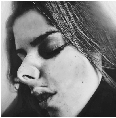
Working with scanner