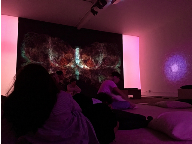
AHATA ANAHATA, MANIFEST UNMANIFEST X Environmental Composition 2015 #1: Light Point Drawings No. 19, 20, 21 and 22 (2015)

23 ft x 14 ft; mixed media: black wrap with pinholes, translucent paper, and video (August 18 – October 8, 2016)