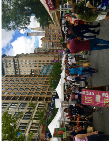
Union Square Park