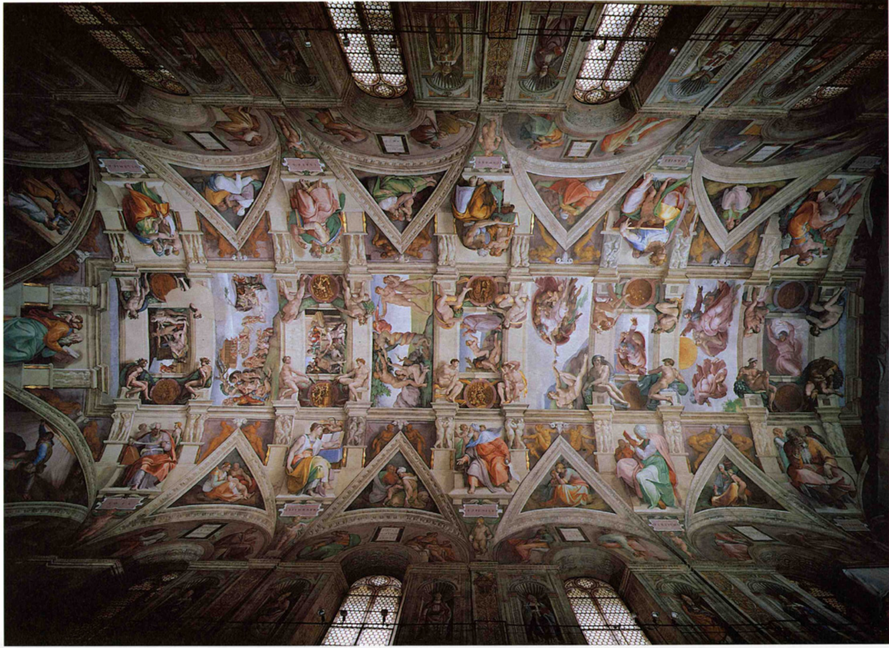
22-13 MICHELANGELO BUONARROTI, ceiling of the Sistine Chapel, Vatican City, Rome, Italy, 1508 – 1512. Fresco, approx. 128' x 45'.