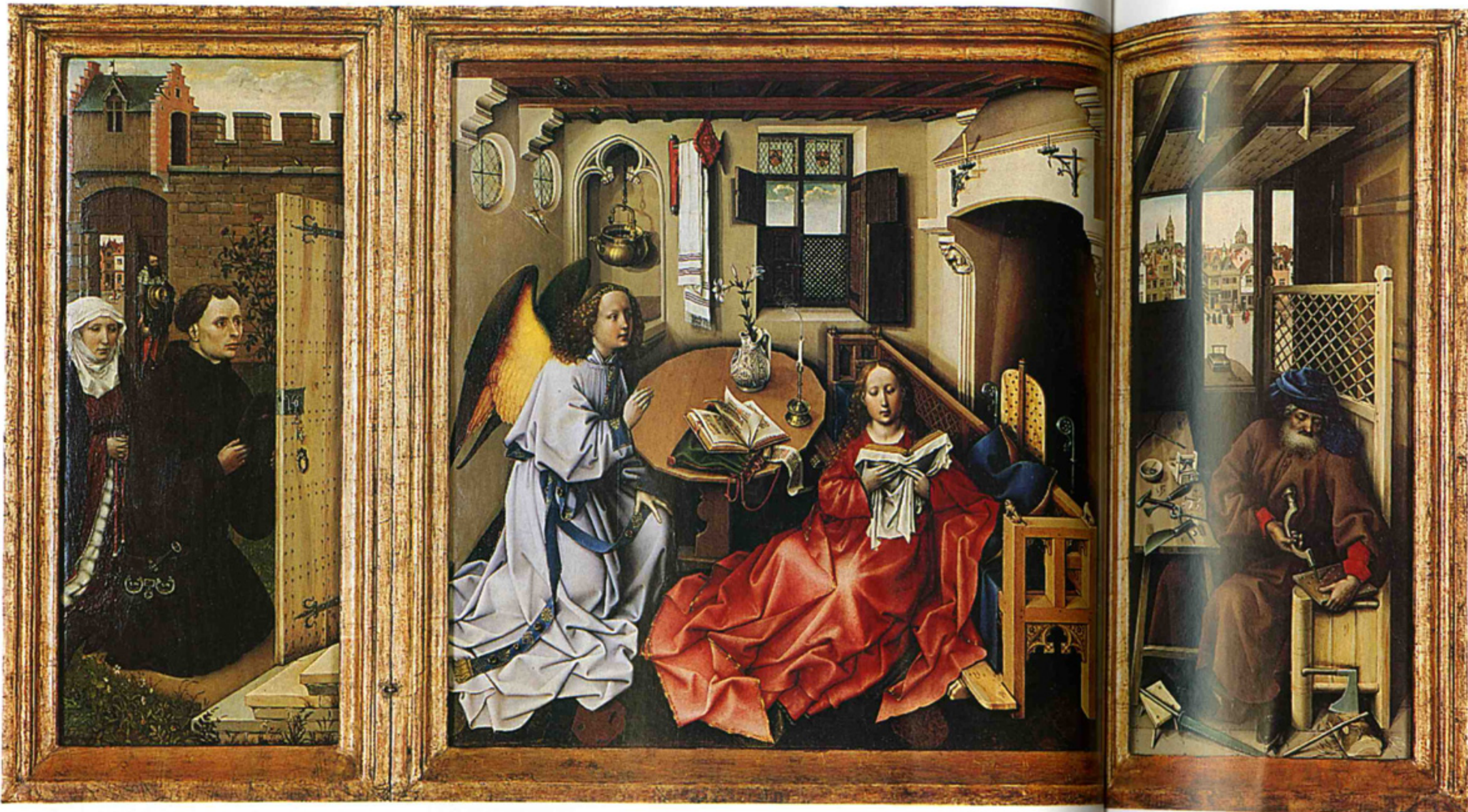
20-11 MASTER OF FLÉMALLE (ROBERT CAMPIN?), Mérode Altarpiece (open), The Annunciation (center panel), ca. 1425–1428. Oil on wood, center panel approx. 2' 1" × 2' 1". Metropolitan Museum of Art, New York (The Cloisters Collection, 1956).