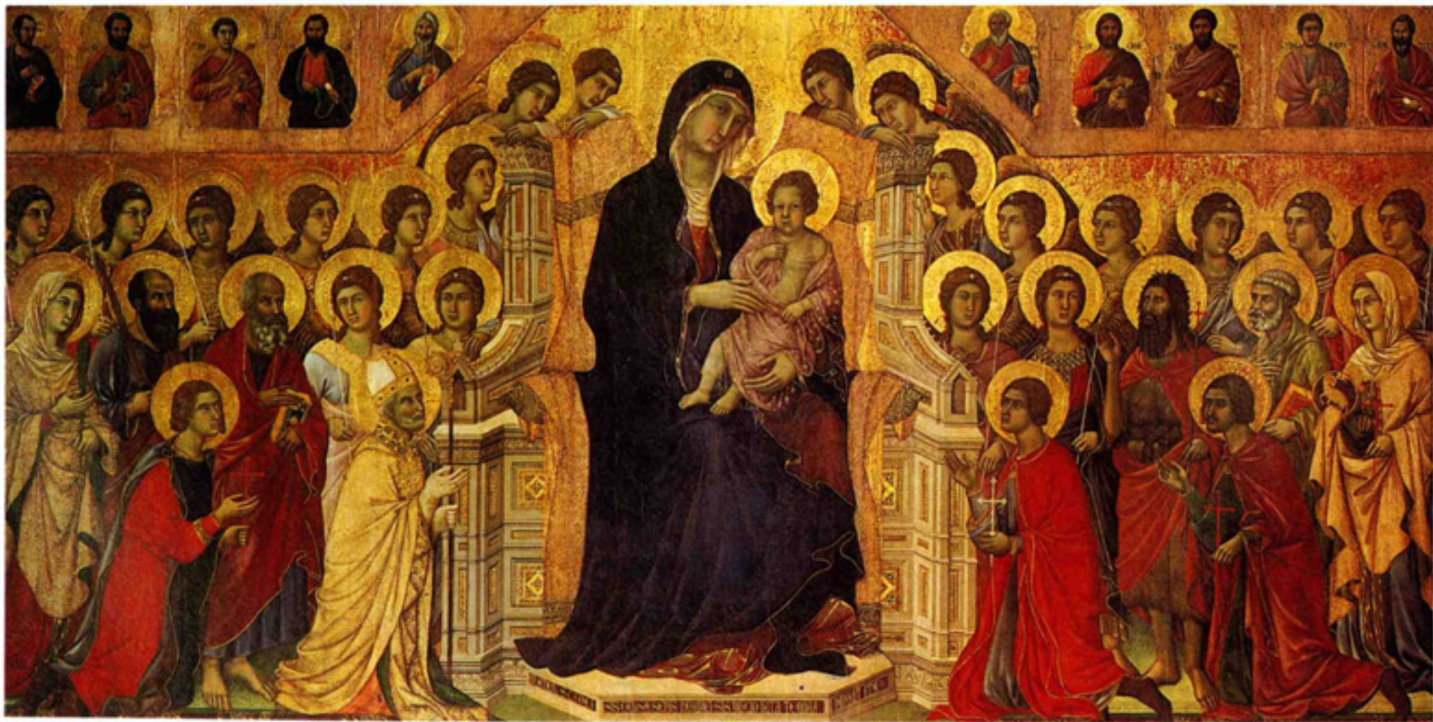
19-16 Duccio di Buoninsegna, Virgin and Child Enthroned with Saints , principal panel of the Maestà altarpiece, from the Siena Cathedral, Siena, Italy, 1308–1311. Tempera on wood, panel 7' × 13'. Museo dell'Opera del Duomo, Siena.