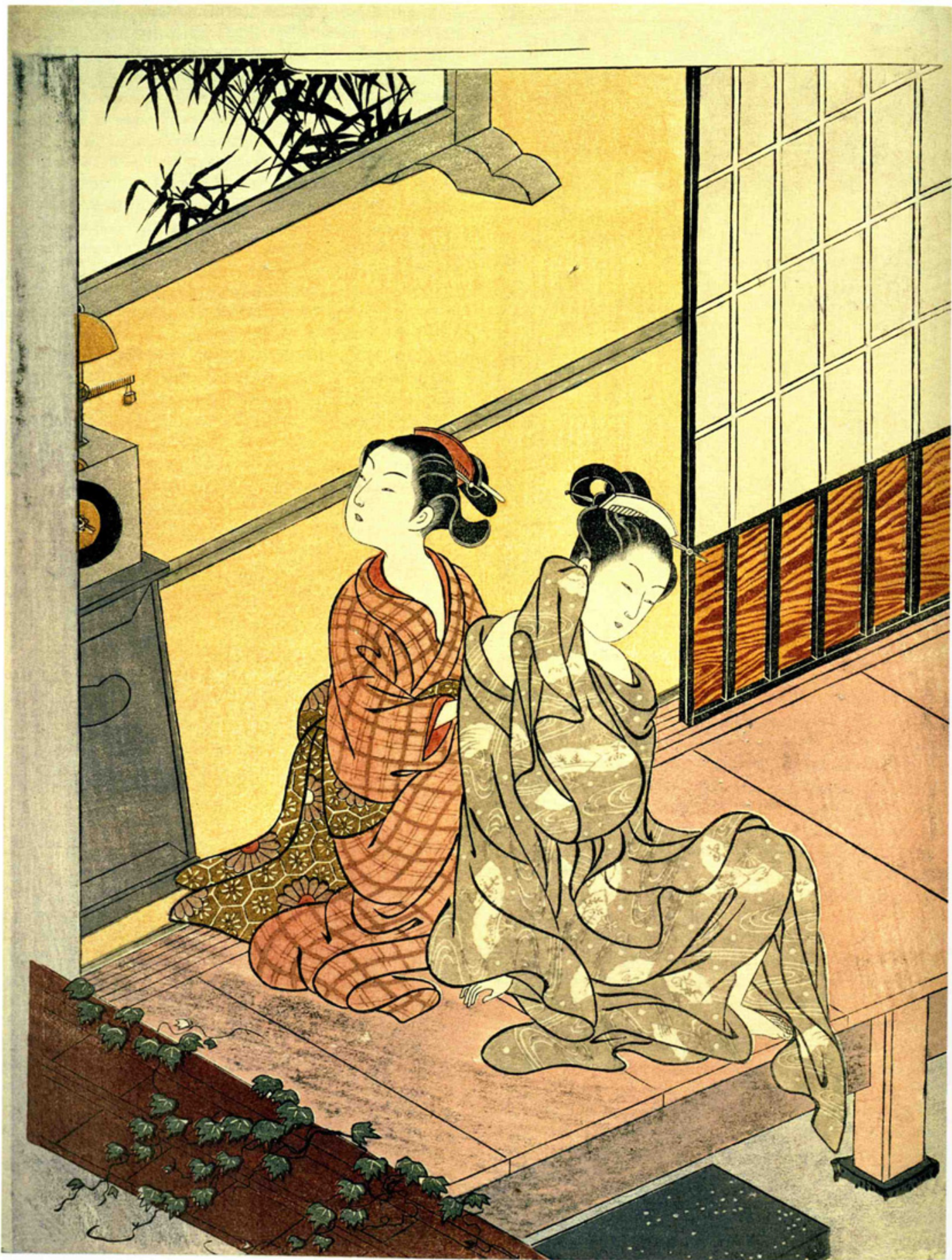
27-14 SUZUKI HARUNOBU, Evening Bell at the Clock , from Eight Views of the Parlor series, Japan, Edo period, ca. 1765. Woodblock print, 11 \frac{1}{4} " \times 8 \frac{1}{2} ". Art Institute of Chicago, Chicago (Clarence Buckingham Collection).