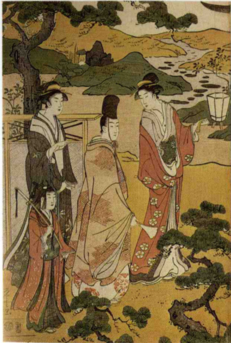
Colorplate 7. EISHI. Evening Under the Murmuring Pines . c. 1800. Color woodcut.