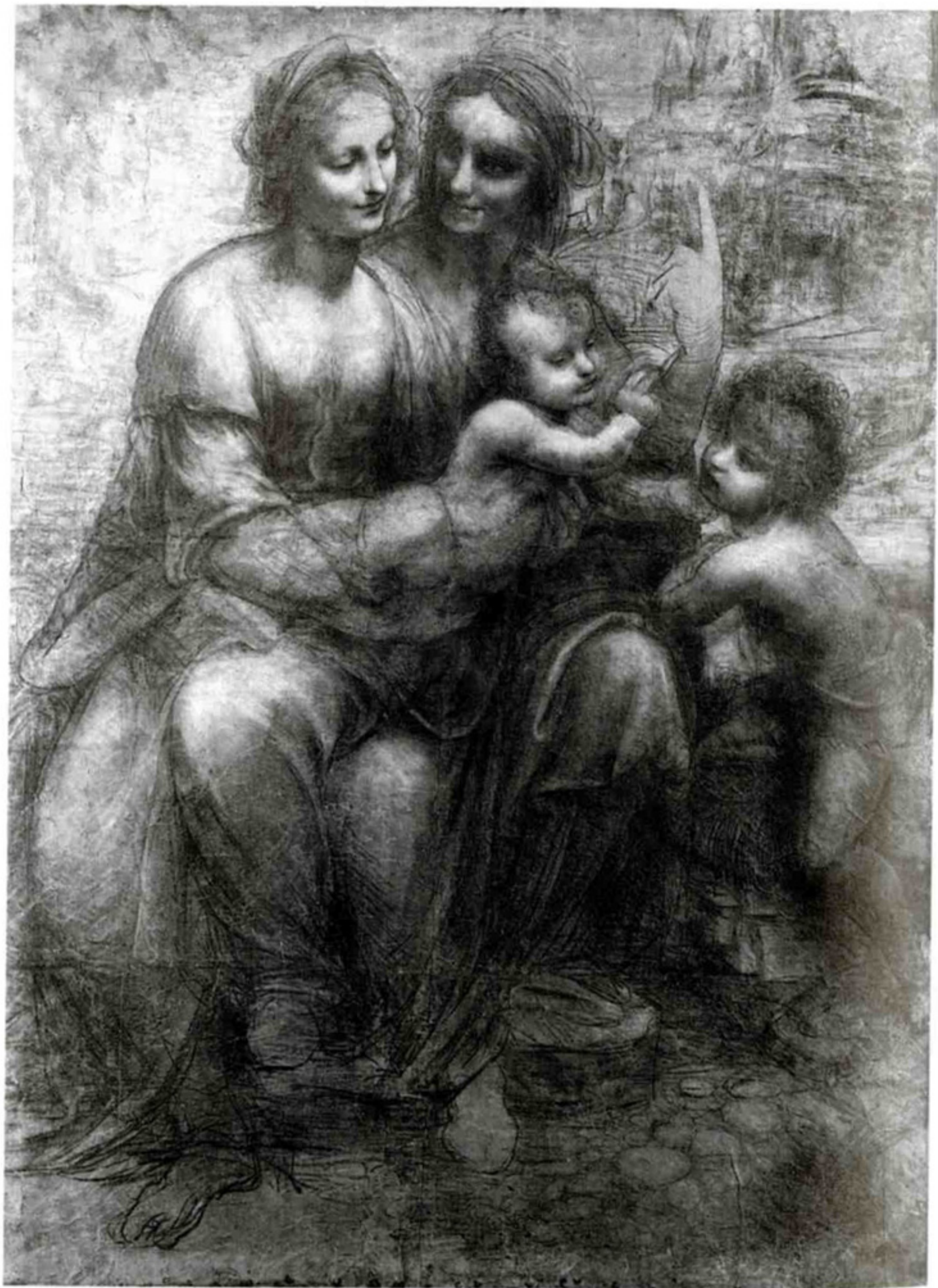
22-2 LEONARDO DA VINCI, cartoon for Virgin and Child with Saint Anne and the Infant Saint John , ca. 1505–1507. Charcoal heightened with white on brown paper, approx. 4' 6" × 3' 3". National Gallery, London.