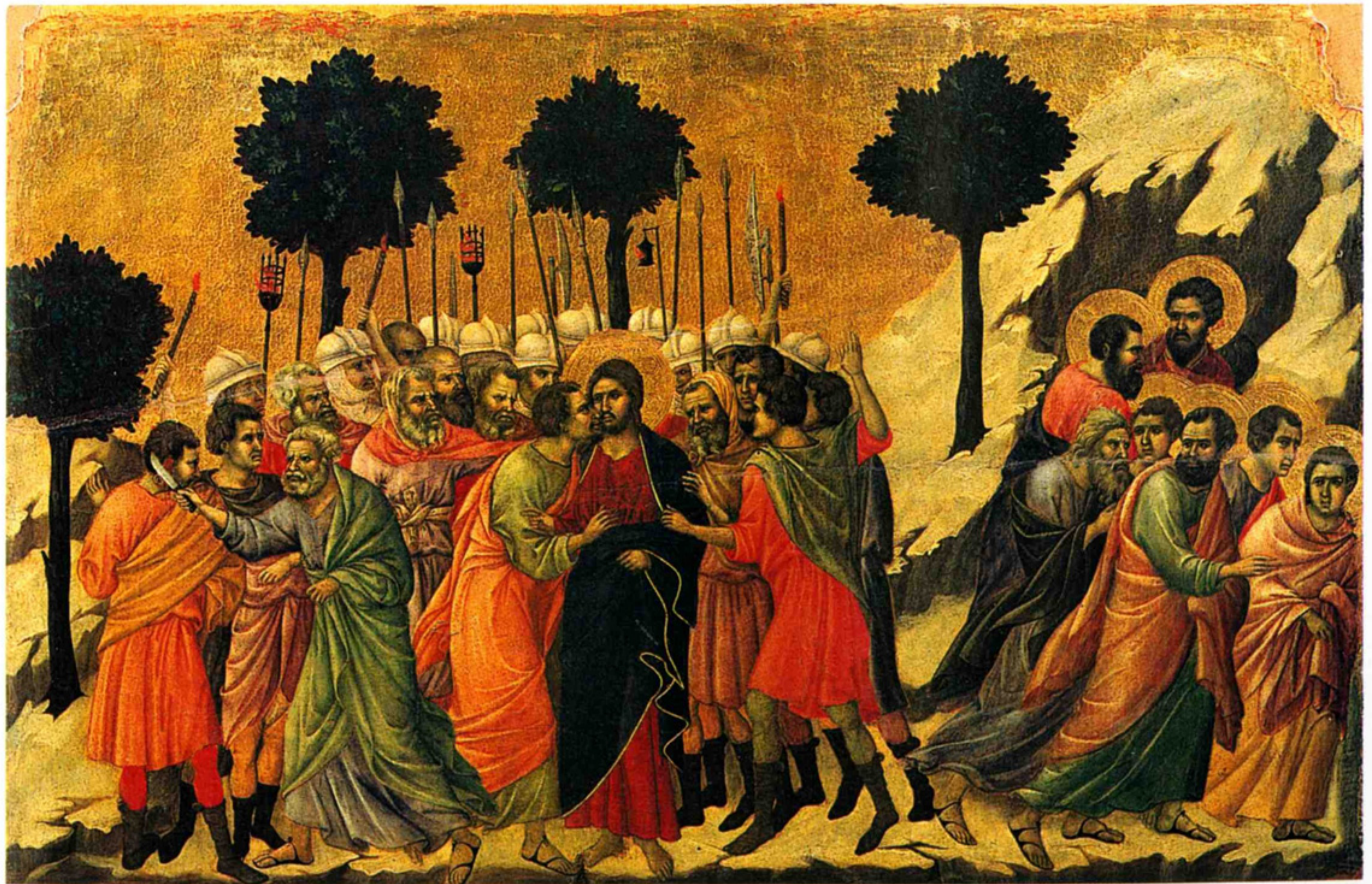
19-17 Duccio di Buoninsegna, Betrayal of Jesus , detail from the back of the Maestà altarpiece, from the Siena Cathedral, Siena, Italy, 1309–1311. Tempera on wood, detail approx. 1' 10 \frac{1}{2} " \times 3' 4". Museo dell'Opera del Duomo, Siena.