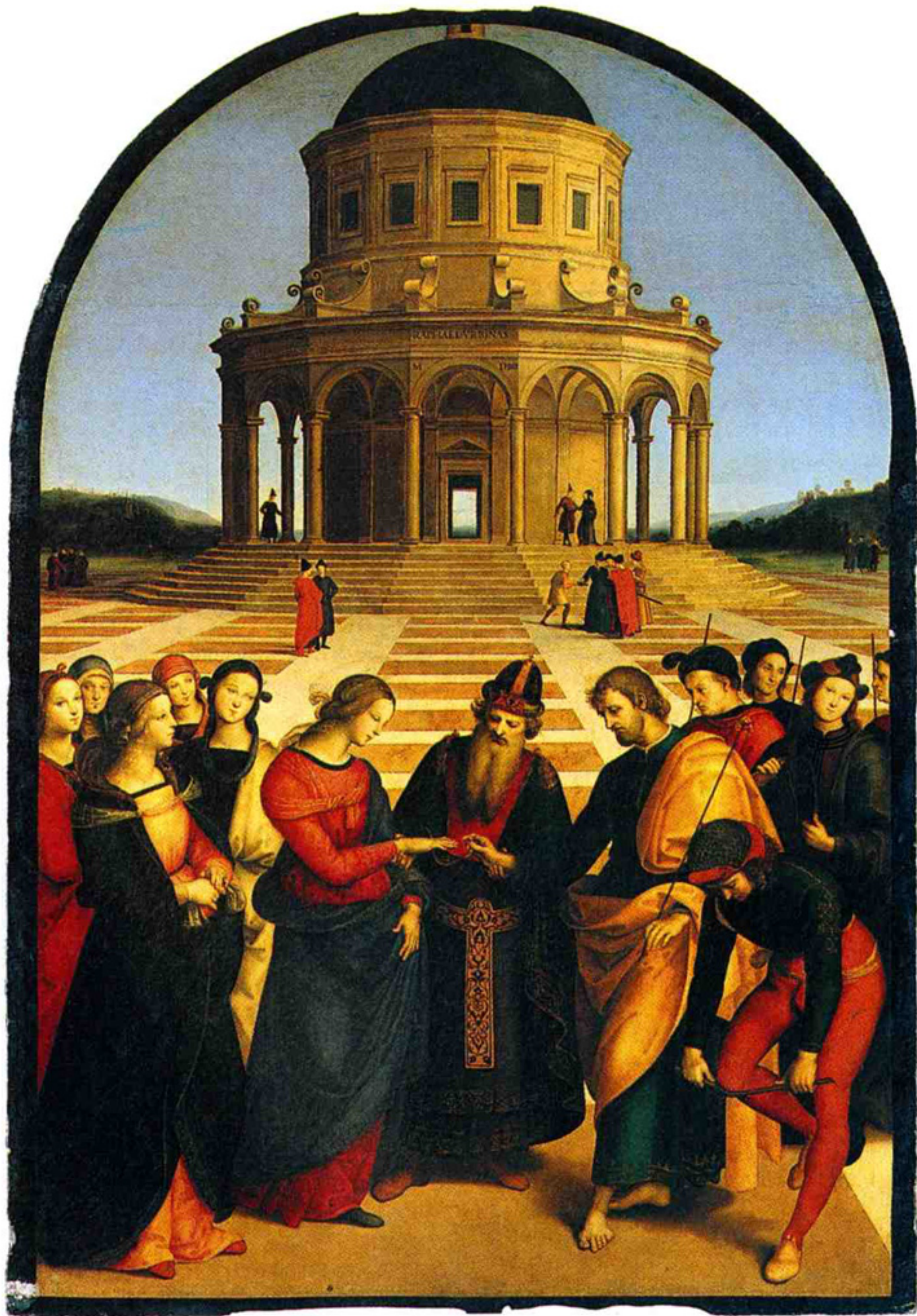
22-18 RAPHAEL, Marriage of the Virgin , from the Chapel of Saint Joseph in San Francesco in Città di Castello, near Florence, Italy, 1504. Oil on wood, 5' 7" × 3' 10 \frac{1}{2} ". Pinacoteca di Brera, Milan.