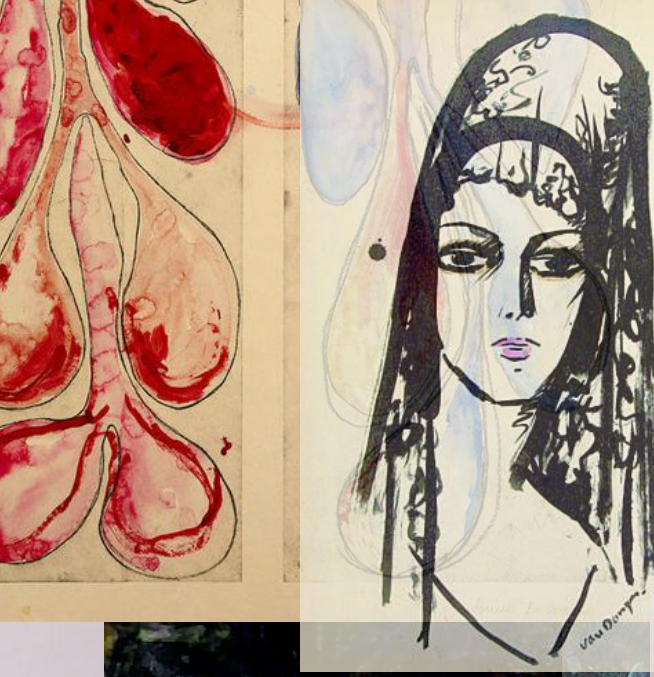
Louise Bourgeois, UNTITLED, 2004, Courtesy of Cheim & Read, New York; Galerie Karsten Greve, Köln; Galerie Hauser & Wirth, Zürich / VBK, Wien, 2005.

MATISSE AIX-EN-PROVENCE PAVILLON DE VENDOME TOUS LES JOURS DE 9 H. 30 A 12 H. ET DE 15 H. A 20 H. SAUF LUNDI MATIN