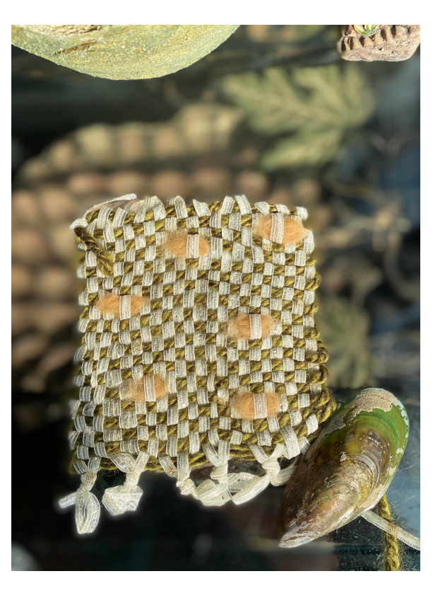
Felting & Waving all used sustainable materials