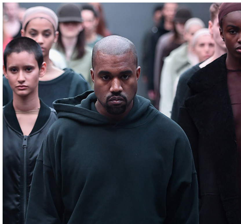
Figure 2 - Adidas Originals x Kanye West YEEZY SEASON 1, New York Fashion Week - February 2015

This video is not a documentary. It is a film which shows through editing, my love for those two worlds; that is why it does not include every aspects of the topic, and the negatives effects that the two worlds can have on each other. My main goal is that the viewer doesn't need to watch this short movie from minute 1 until the end, but that anyone can come at a random moment and be able to understand the relations between the different interviews/fashion shows/images and music videos that I have collected. The purpose of this project is to show, with the resources that I have collected but also with the rhythm and the editing, that hip-hop and rap and fashion have a similar energy and that both of these two worlds are in fact a way of designing the person that one wants to be.