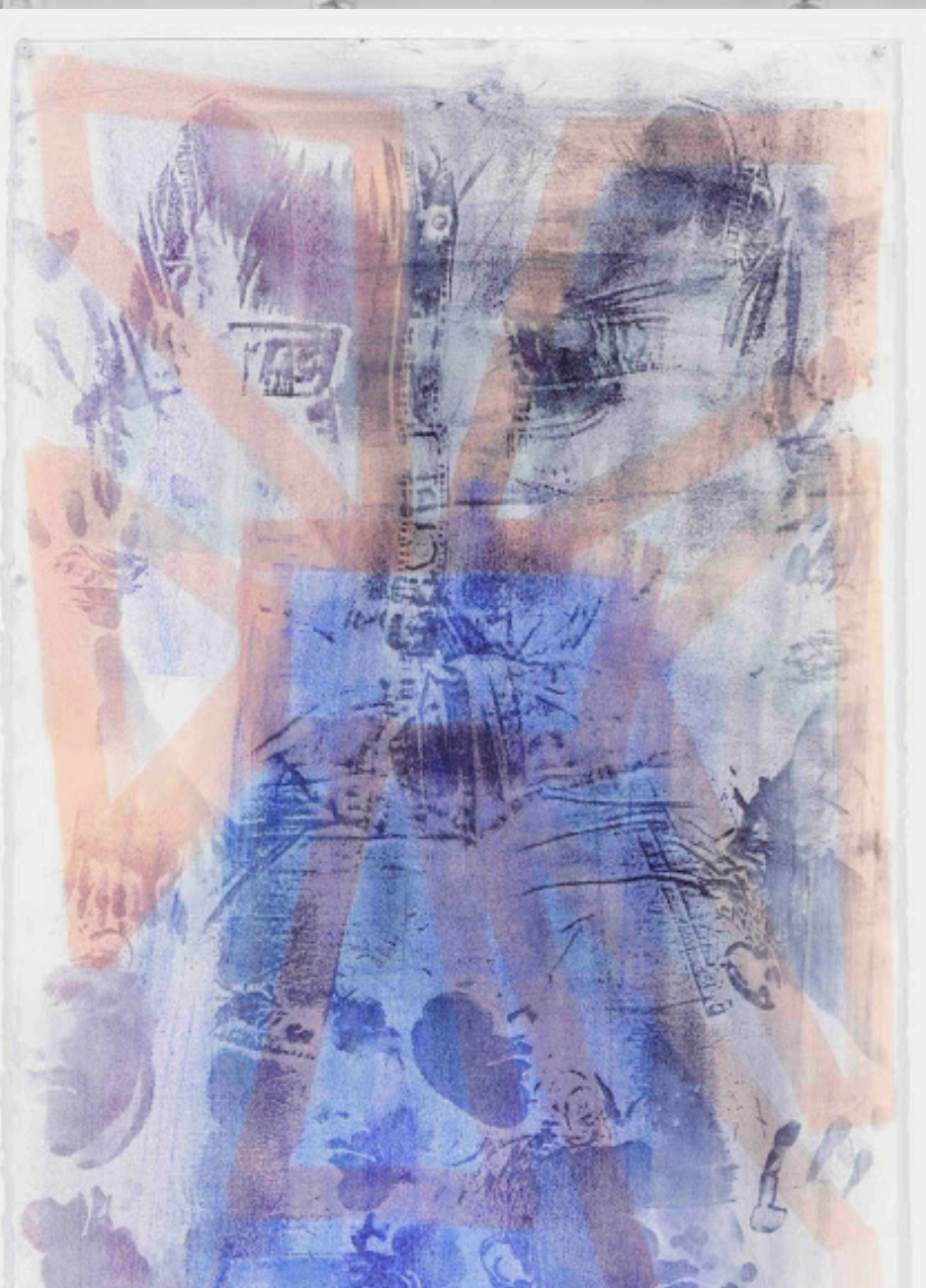
Research Topic: Toxic Masculinity / Misogyny in Horror Films