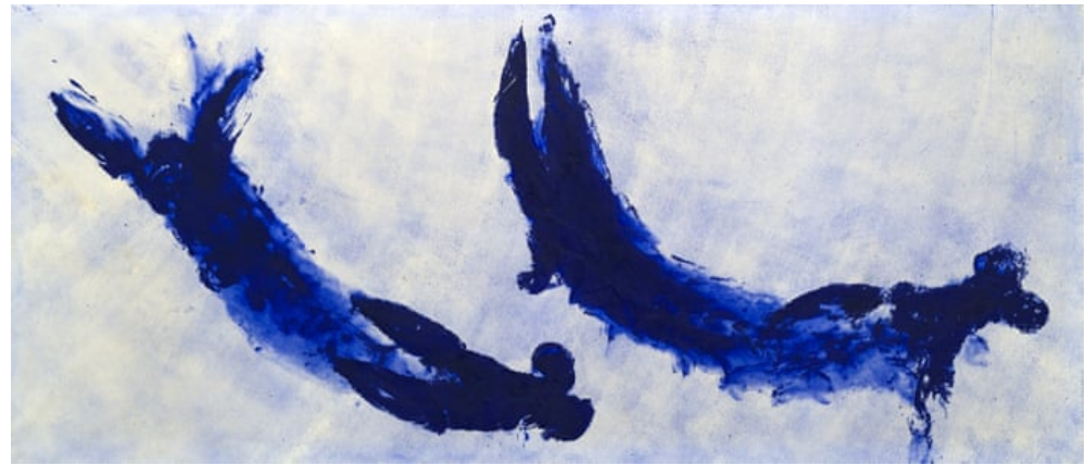
Exs for Collage: Yves Klein, Anthropometres