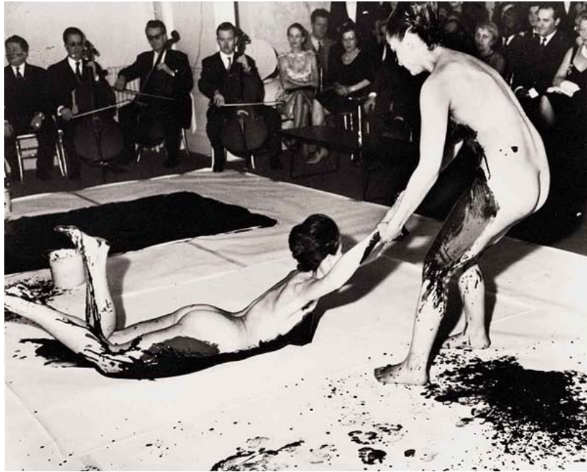
Research Topic: Toxic Masculinity / Misogyny in Horror Films