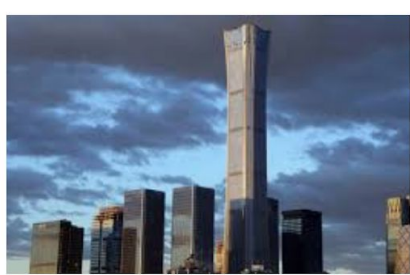
China built more skyscrapers in 2018 ... cnn.com