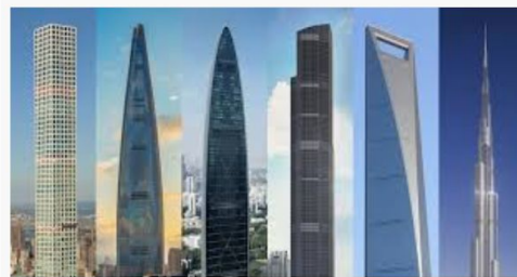
Tallest Buildings ... archdaily.com