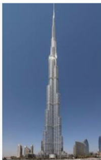
Skyscraper - Wikipedia en.wikipedia.org