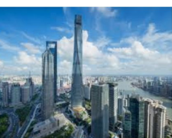
Surprising Facts About Skyscrapers ... ...com