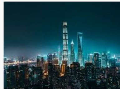
10 Skyscrapers Changing City Skylines ... redbookmag.com