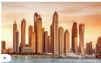
What is a Skyscraper? | The B1M - YouTube