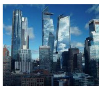
Skyscrapers - latest news, breakin... independent.co.uk