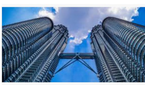
The only 15 skyscrapers to ever be 'The ... businessinsider.com