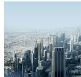
The New Golden Age of Skyscraper