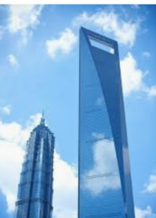
The 27 Most Beautiful Skys... architecturaldigest.com