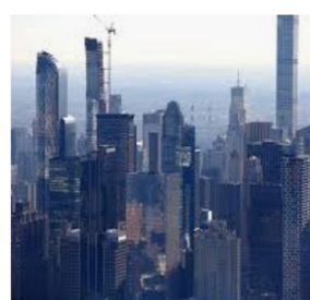
The skyscraper indicator shows ... marketwatch.com