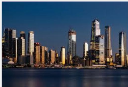
Glass skyscrapers: a great ... theconversation.com