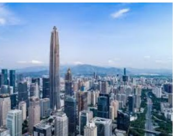
Report: The year 2017 in skyscrapers ...