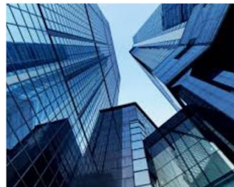
How long should a skyscraper live for?