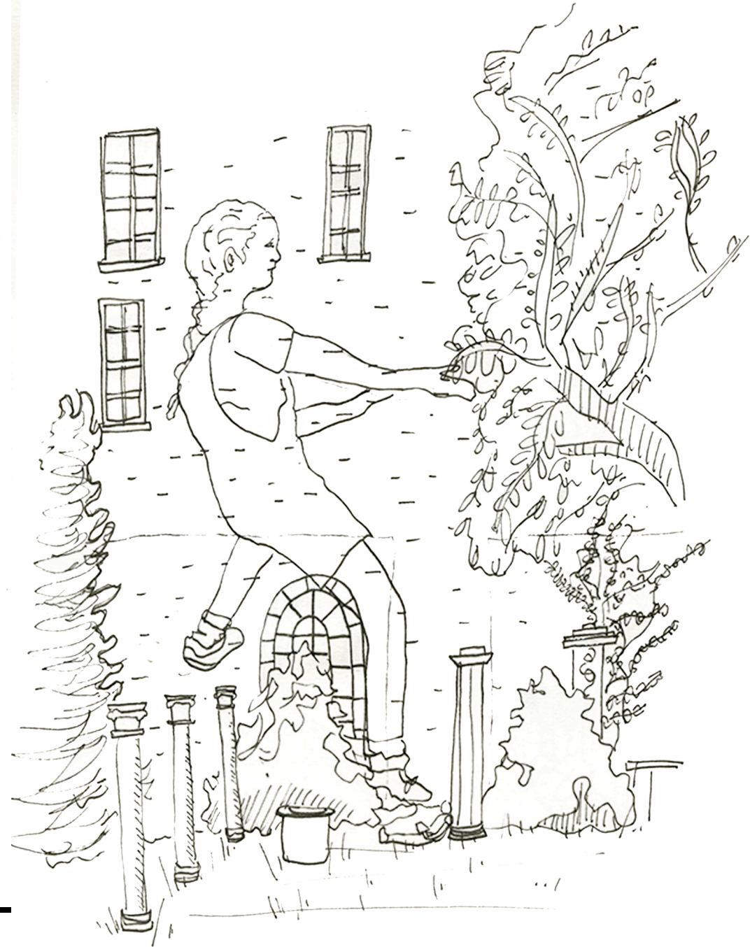
The original site of P.S. 106, later renamed P.S. 21, was designed by architect C.B.J. Snyder in 1903 with a public outdoor space that functioned as a neighborhood social and civic center.