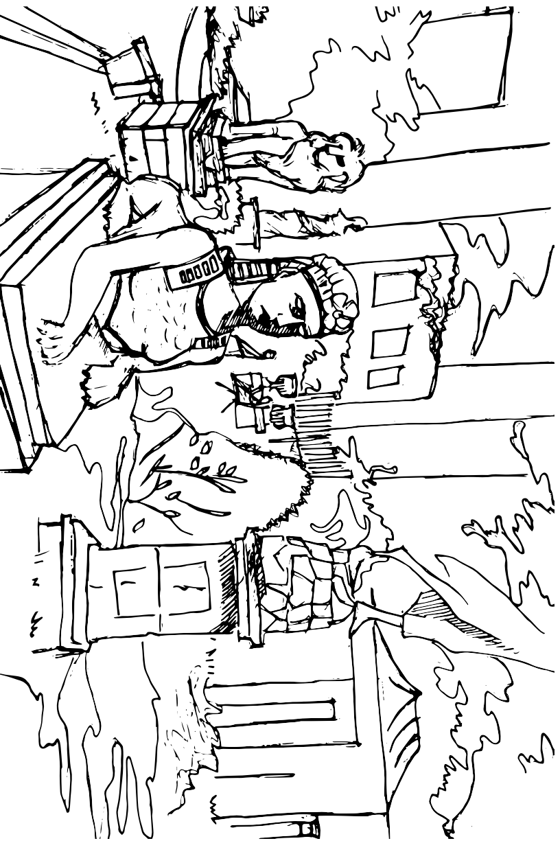
Aside for Elizabeth Sreet Garden in CB2, which is the district made up of Little Italy and Soho, all the rest of the land is paved.