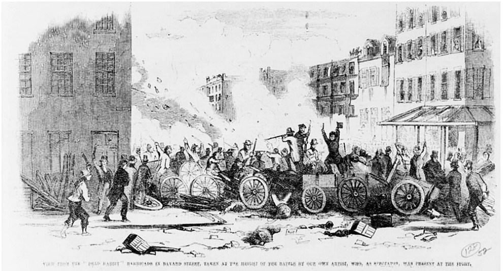
VIEW FROM THE "DEAD RABBIT" BARBICANE IN BAYARD STREET, TAKEN AT THE HEIGHT OF THE BATTLE BY OUR OWN ARTIST, WHO, AS MURPHY'S, WAS URGENT AT THE FIGHT.