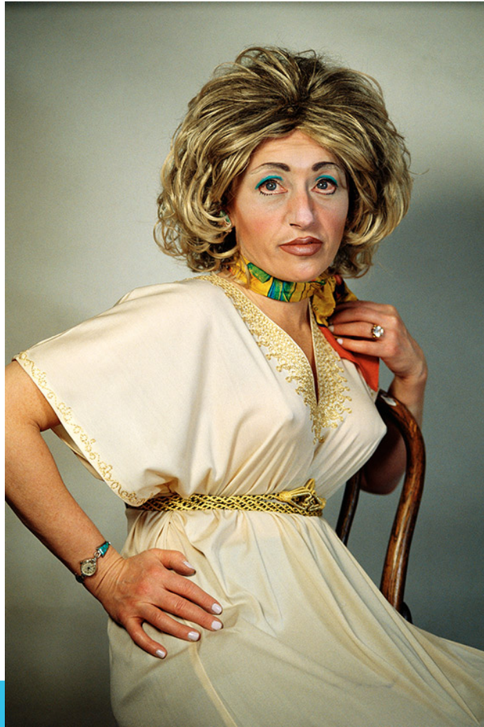
Untitled #353.2000 Chromogenic Color Print