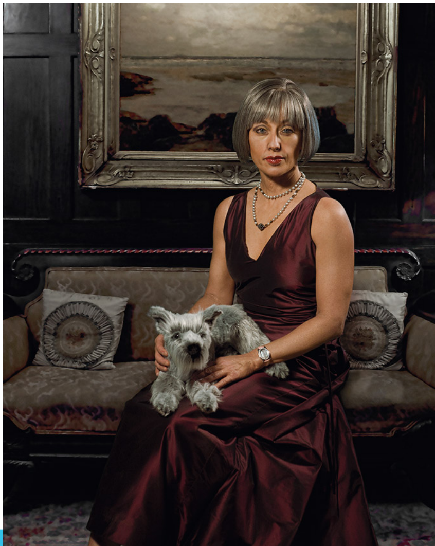
Untitled #476.2008 Chromogenic Color Print