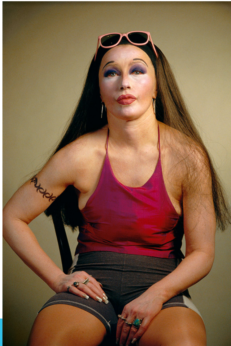
Untitled #355.2000 Chromogenic Color Print