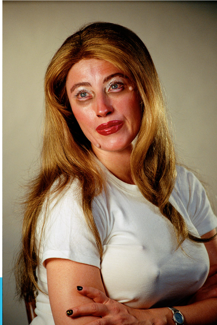
Untitled #360.2000 Chromogenic Color Print