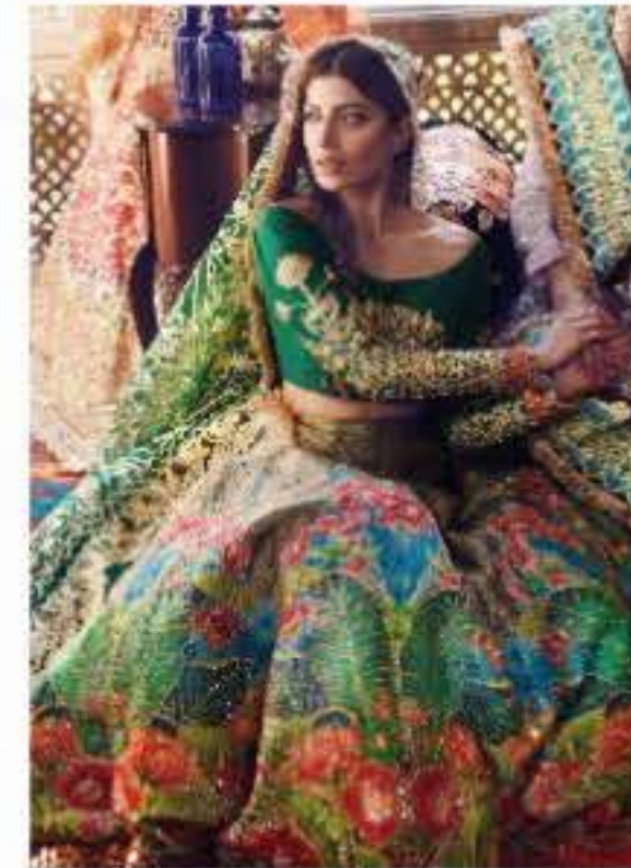
Every 20 minutes, a woman dies in Pakistan of maternity-related complications and that out of every 100 females 40 percent are married below the age of 18. Photo for illustrative purpose only