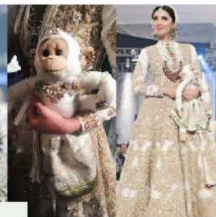
Designer Ali Xeeshan teams up with UN Women to challenge child marriage in Pakistan