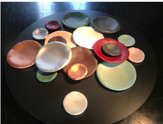
Canova Moustache, 2016 Ceramic Moustache Collection, Paris

The series of plates 'Moustache' made in 2016 by the artist Canova is displayed in the Musée des Arts Décoratifs in Paris. This artwork was first created by hand using ceramics that would recall the shape of a circular item used to eat. This modern piece is made of various circles are in different sizes and colours, which may recall dishes for different meal's portions. I believe that this artwork was simply create for aesthetic purpose as the bright colours pops out to the viewers that are attracted by those shapes that seems touchable and quite personal, as everyone that touches the object gives to it a transformation and a mark that would last forever. Created in the latest years, the composition that is created is quite simplistic as the circles are displayed on a black surface and they are placed in a messy order that does not seems like it was thought through, giving a connotation of playfulness and childless to the piece.