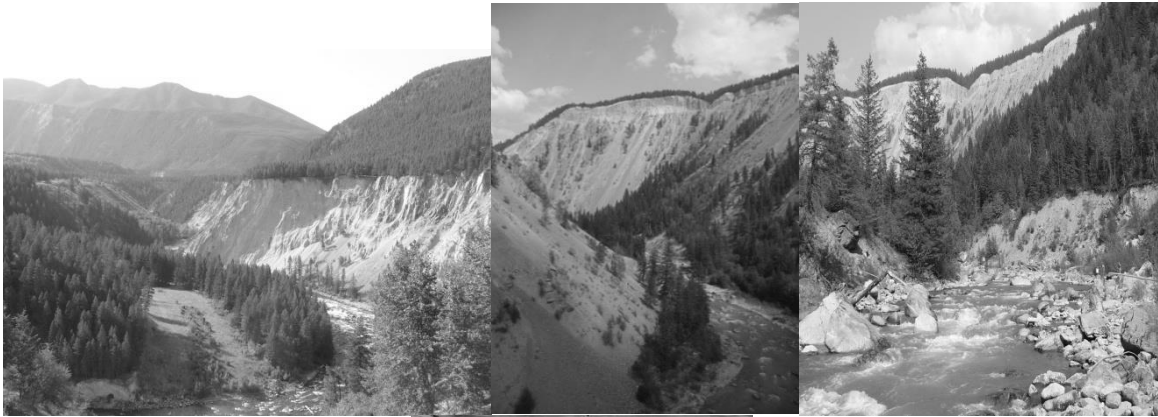
EXHIBIT 1: LOST CREEK ANGLING CO. WILDERNESS CAMP