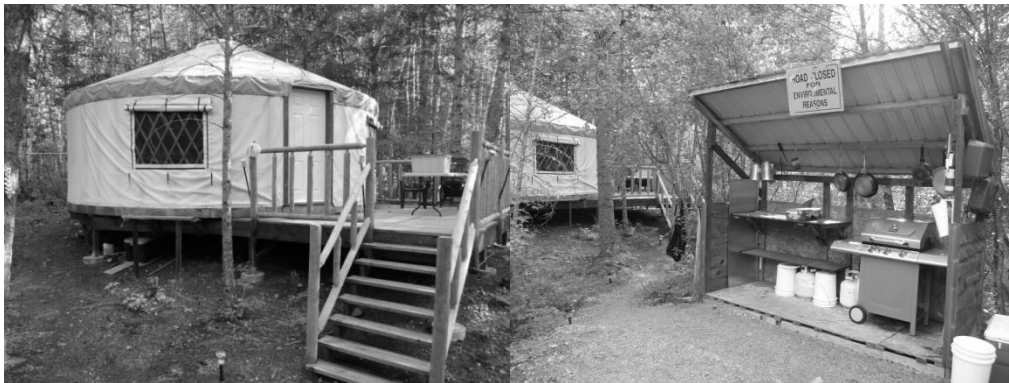
EXHIBIT 2: THE YURT AND KITCHEN