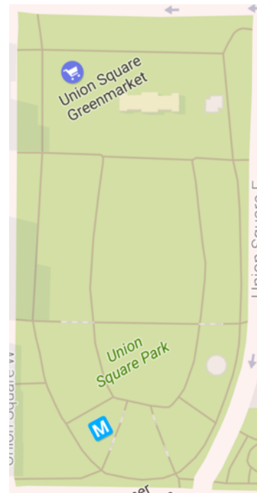
Union Square Abstract Map