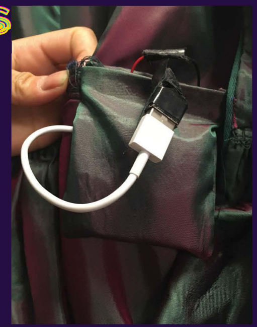
REMOTE CONTROLLED LEDS