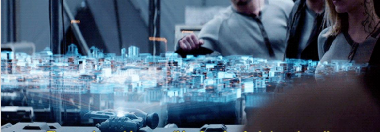
3d Projection map from phone