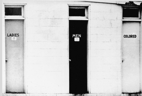
1964: no more racially segregated bathrooms