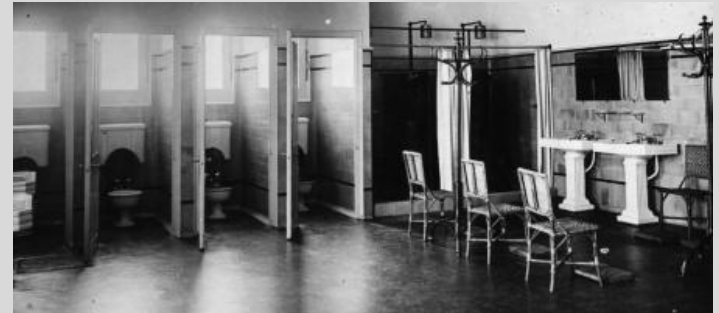
Mid 20th century women's bathroom