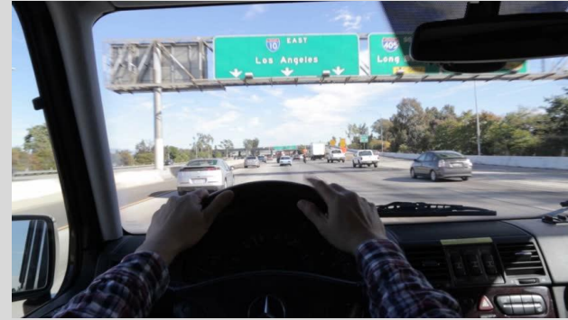
transparent arrow guide shown on car window