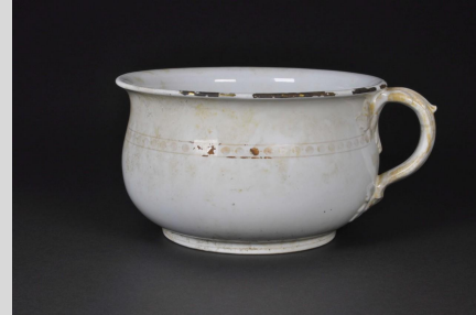
19th century: barely any indoor toilets, outhouses and chamber pots