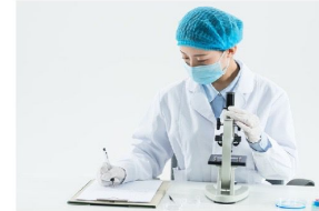
Researching, turning into re-usable fabric