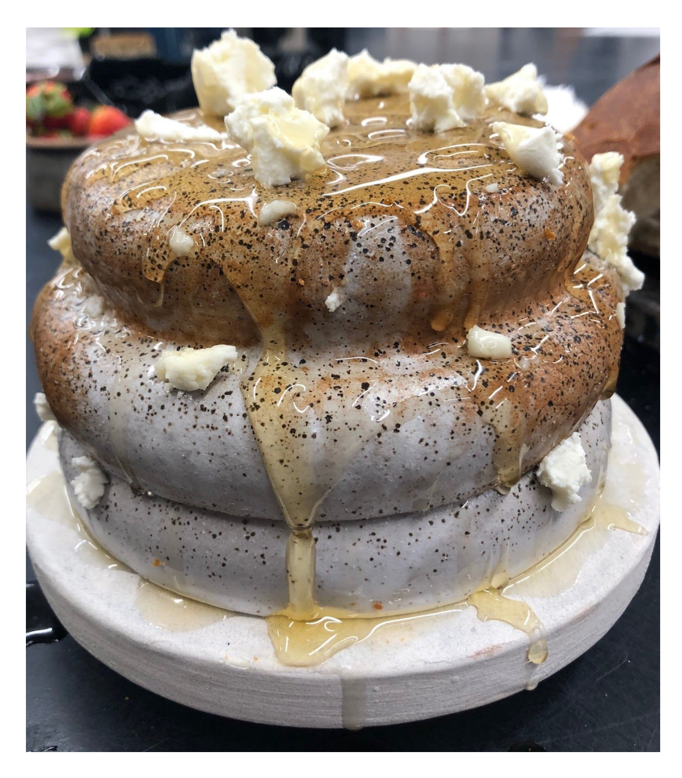
Food is the only thing that consumes my mind and ceramics is a way that I feel like I am able to play with it further.