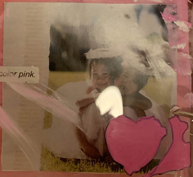
there is no color prettier than the color pink.