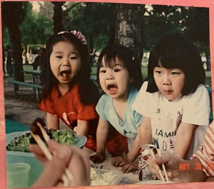
i have always been pink, and my sister has always been blue.