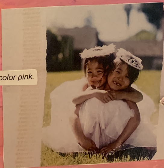
there is no color prettier than the color pink.