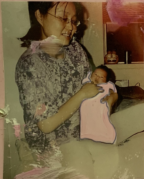
pink has always been my color.