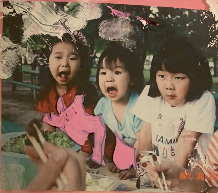
i have always been pink, and my sister has always been blue.