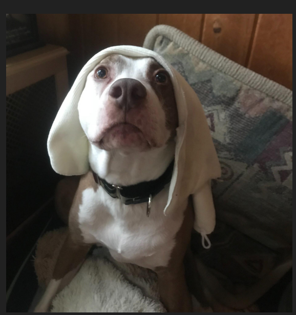
At his new home!