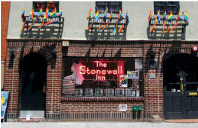
Left: Stonewall Inn, Right: Stonewall Riots

The swings will not only educate people about the LGBTQ pride but it will act as a recognition for those who fought for the gay liberation through riots and parades. Close to this plaza, there were gay bars and one of the well know place was Stonewall Inn, although it was publicly known for private bar, having conflicts with corrupt cops, there began the pride riot. Though this uprising did not start the ‘gay rights movement, it was a galvanizing force for LGBT political activism’. 5 Therefore, through the swings, people will be inspired and will take more respect towards the history and people within.