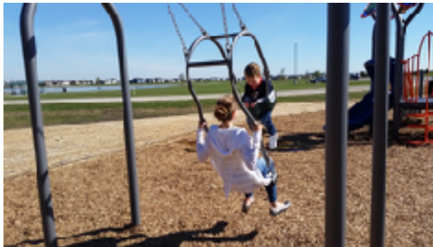
Left: Tandem Swing Right: Porch swing

center cross bar. 2 The Tandem swings fit my idea and intention towards the final project because these swings were first invented for mother to swing with the child for safety. This idea reflects on the mother's love towards the child and this infinite love also fits into my idea of love shared between two people. I looked closely at the Porch swings because the project will be built in the center of the public, safety is very important. Porch swings require less action and this ride doesn't swing too violently. Also Porch swings are often at people's gardens for families to use which can give comfort to the people from the neighborhood and the passer-by.